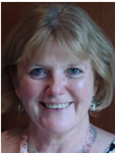
Cabinet Member for Education, Welsh Language, Leisure & Culture