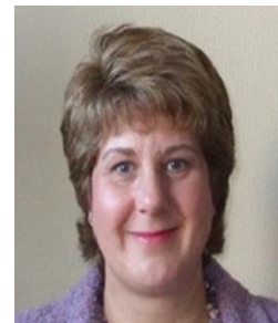
Chief Officer Education & Youth